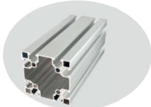
市面上采用国标铝材 Others use international common aluminum section

Machine uses main framework structure design, made of EN standard specified aluminum extruded section, strong and beautiful.