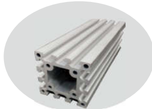
我司订制欧标加厚铝材 We use specified aluminum extruded section